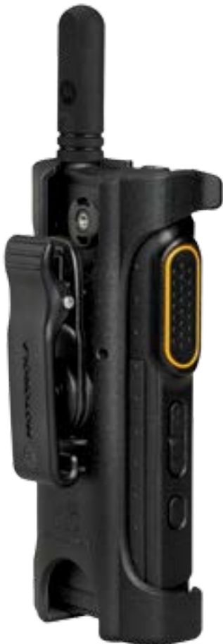
PMLN7190 Carry Holder/Holster with Swivel Belt Clip

By spending countless hours in the field with customers, we've developed accessories that aren't just the most innovative. But also the most useful.