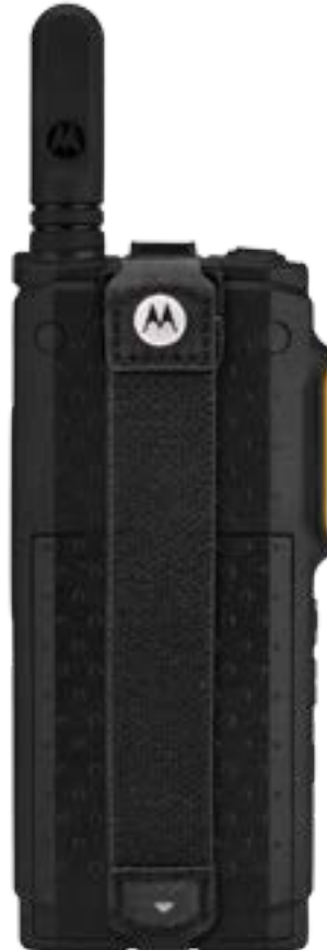
PMLN6074 Nylon Wrist Strap