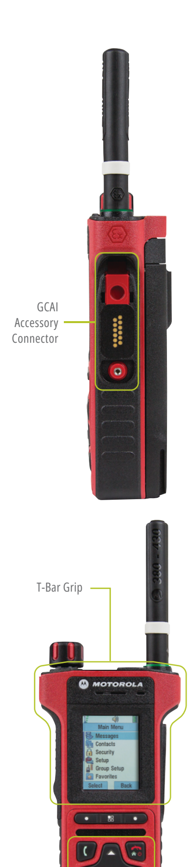
The MTP8500Ex has a limited keypad, ideally suited for use while wearing heavy gloves. For users that need a full keypad we offer the MTP8550Ex.