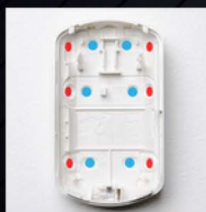
Flexible mounting points