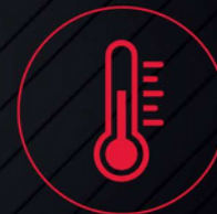
Digital temperature compensation