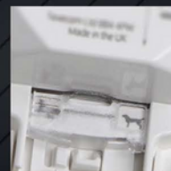
EN certified selectable pet immunity option