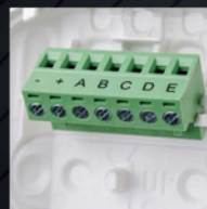
Adjustable terminal block