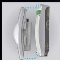
Front-loaded fully sealed electronics