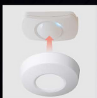
Ceiling mount cover