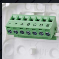
Adjustable terminal block