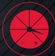
Automatic sensitivity adjustment

We understand that reliability underpins the fundamental trust in an intrusion alarm system and has developed this range to be our most reliable, most resilient, most robust and most trustworthy range of motion detectors, to date.