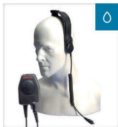
CXR5/DT9* Bone conductive skull mic with heavy duty PTT