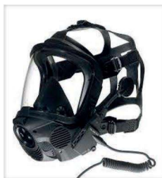
3rd Party BA Supports 3rd party BA comms kits