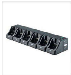
CSBHT Intelligent six-pod rapid charger

Supplied package includes: Li-Ion battery pack, rapid drop-in charger, belt clip, high-efficiency antenna and quick-start user guide.