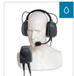
CHPD/DT9* Double sided ear defender headset with headband