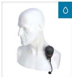
CMP/DT9 Heavy duty speaker microphone for DT800FF and DT900FF series