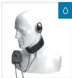
CXR16/DT9* Throat mic / earpiece with heavy duty PTT