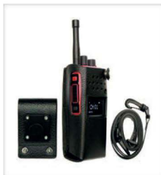
CLCDT5 A heavy duty leather carry case with swivel belt loop and strap