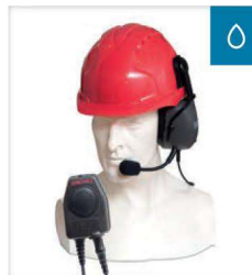
CHPHS/DT9* Single sided ear defender headset for hard hat use